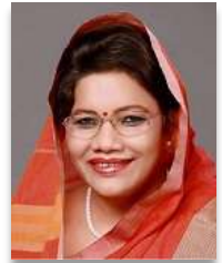
Minister of State, Smt. Renuka Singh Saruta