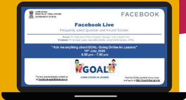
FB Live Q&A Session

3,000 participants attended the webinars