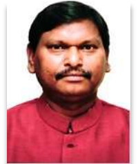
Minister of Tribal Affairs, Shri Arjun Munda

On 15th May 2020, Hon'ble Minister of Tribal Affairs, Shri Arjun Munda launched GOAL initiative, a Facebook funded program in collaboration with the Ministry of Tribal Affairs aimed at upskilling and empowering tribal youth across India to become digital young leaders. This event was also graced by the presence of Hon'ble MoS, Smt. Renuka Singh Saruta.